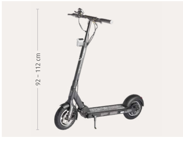
Comfortable ride guaranteed – the height of the handlebar can be freely adjusted. The big pneumatic tires can easily master the bumpiest gravel tracks.